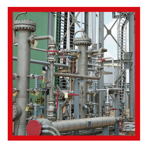
Civil & Construction

National Pipeline Supplies service multiple key industries including: Civil & Construction, Mining, Fire Protection, Power Stations, Water Treatment, Pulp & Paper and the ever popular Wine Industry. Our company is committed to providing continuous innovation, high quality products and value for money to our clients.